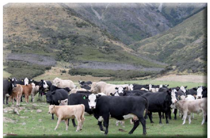
Silverstream bulls out with the cows.

Of the 5200 hectares of the property 1000 hectares can be classed as cultivated, 2500 hectares is over-sown hill and the rest is native hill. 120 hectares is cultivated annually. Rape is usually sown first followed by one or two turnip/Italian ryegrass crops then back into grass again. There is an average rainfall of 40 inches and the property gets snow approximately three times a year. On our visit to Lochiel, Hamish had just finished a full