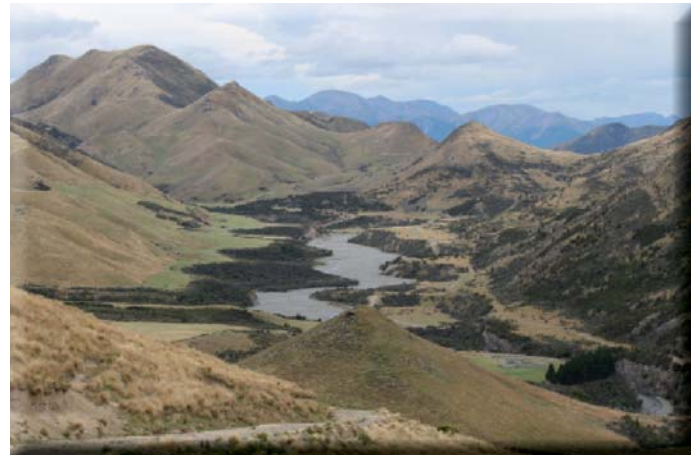
Hamish and Maryann's favourite view.

muster in order to get his lambs prepared for his annual on farm lamb sale. The flock consists of 7000 breeding ewes which made up of Perendale and Romdale ewes. The ewes are shorn every 12 months pre-lamb. 2000 ewes lamb slightly earlier in September to a terminal sire while the main flock starts in October. In the on-farm lamb sale there are usually about 6000 lambs for sale.